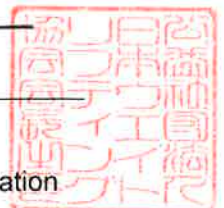
Yuriko Koike, President, Japan Weightlifting Association Governor of Tokyo

Looking forward to seeing you all in Tokyo,.